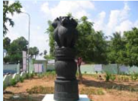
The Ashoka Pillar at the Memorial Park