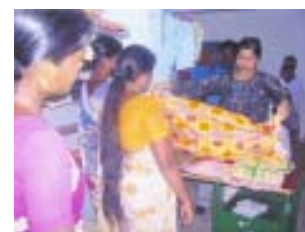
Alaimakal products for sale

cream vending, retailing ready-made clothes purchased from wholesalers, hollow brick making and tailoring. The products are popular under the brand name "Alaimakal" (the daughter of the waves). The monthly saving of each member has grown to Rs.100-125 per week, which is more than their pre-tsunami enterprise fetched.