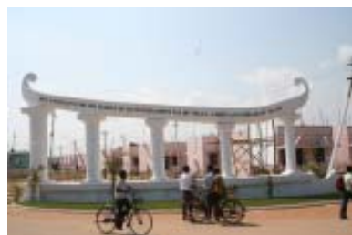
The archway to Puthu Nagar

Prior to the Tsunami, except the 10 dalit families who lived in thatched shelters, the villagers lived in colony of houses by the sea. After the devastation, they moved to the discomfort of temporary shelters near the Collectorate.