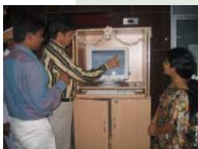
A touching moment - Dr. J Radhakrishnan IAS inaugurating the touch screen at the Collectorate

The District Collector, Dr. J Radhakrishnan IAS 'touched' open a touch screen information system for the public at the District Collectorate, Nagapattinam on 21 December 2005. The touch screen, located at the foyer of the Collectorate provides vital information on Tsunami damages and rehabilitation efforts, various publications and studies, and statistics related to Tsunami relief and rehabilitation. This information is available in Tamil and English. The initial interest shown by the public is encouraging. Photographs relating to relief and rehabilitation seem to be the most popular information accessed till date. ■