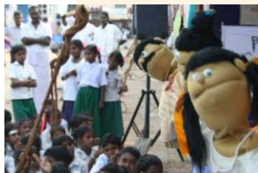
From the mouth of puppets