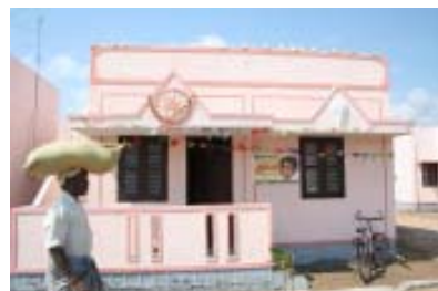
A new house in Puthu Nagar

resembles a township has facilities like street lights, drainage, spacious streets and a beautiful entrance with huge archway and a meadow. Still under construction is a marriage hall, a pre-KG school, and a garbage disposer.