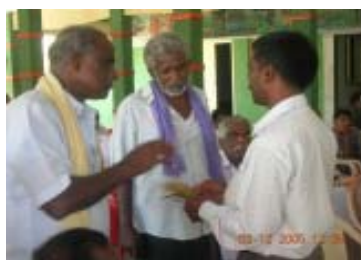
Consultation with farmers

The community's involvement will be the key to all the processes. This involves involvement not only in the planning and implementation processes but also contributing to the venture in cash or kind.