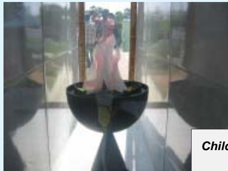
The Memorial Lamp