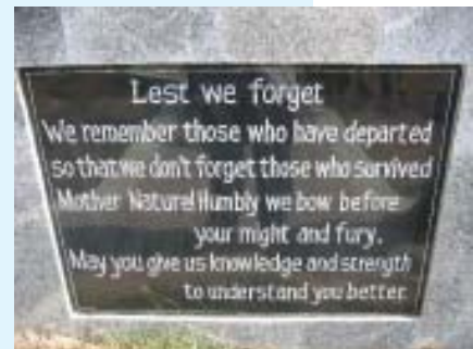
Inscriptions on the Memorial Statue