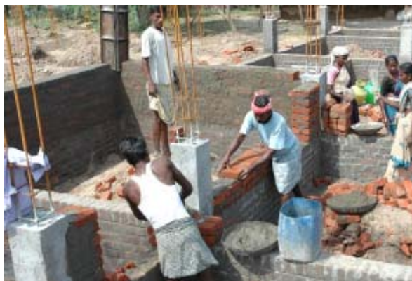
Permanent shelter construction by RDT

RDT has begun the construction of permanent earthquake and tsunami resistant houses for 411 families in 4 villages i.e., Thazhampettai, Vepancherry and Chinnamedu of Nagai District and Vettaikaraveedu of Karaikal District. It is also constructing school buildings and plans to lay the internal roads in the villages and provide drinking water facility.