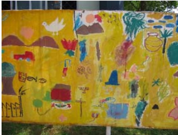
A 72-foot painting by children at the Collectorate as a part of commemorative event organised by the District Collectorate