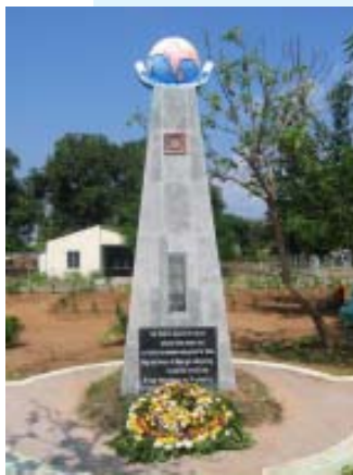
The Memorial Statue at the Memorial Park

A Government-NGO meet was organized in the evening at the Collectorate to acknowledge the work done by NGOs towards relief and rehabilitation. Most of officials and the NGOs working in Nagapattinam participated in the meeting. ■