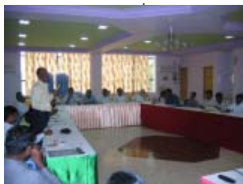
Technical consultation meet

Representatives from various research institutes like MS Swaminathan Research Foundation, Chennai; Tamil Nadu Rice Research Institute, Thanjavur; Soil Saline Research Centre, Trichy; Pandit Jawaharlal College of Agriculture, Karaikal; and from development agencies and donor agencies, and farmer representatives participated in the meeting. More meetings are planned in the month of January as a follow up of this consultative meeting.