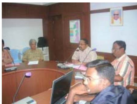
Shelter Advisory Group